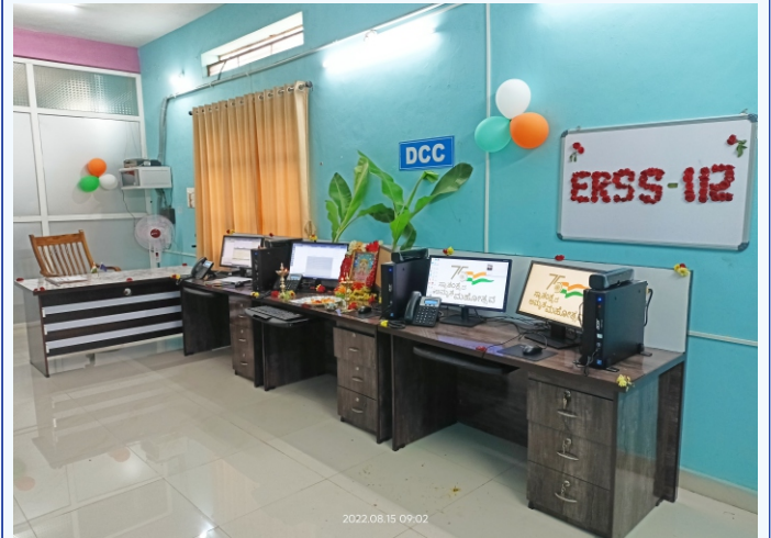
Inauguration of DCC in newly formed Vijayanagara District.

With the integration of Cyber crime & financial fraud calls (1930) to 112, quick assistance is being provided to victims within the golden hour of crime.